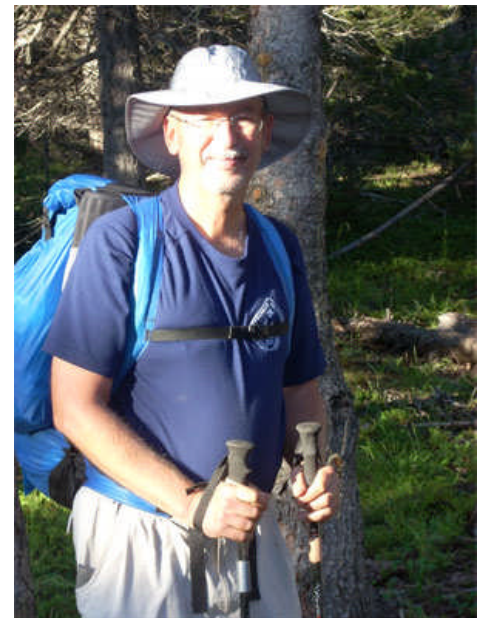
Author on the trail with his Gossamer Gear G5 silnylon backpack and Backpacking Light STIX carbon fiber trekking poles.

Philmont provides scrub pads, toilet paper, and small containers of both dish soap and hand sanitizer that we take. We also bring an additional hand sanitizer bottle with us so that we have them readily available when cooking, eating, or returning from the outhouse. We think this is one of the most important aspects of avoiding sickness on the trail.