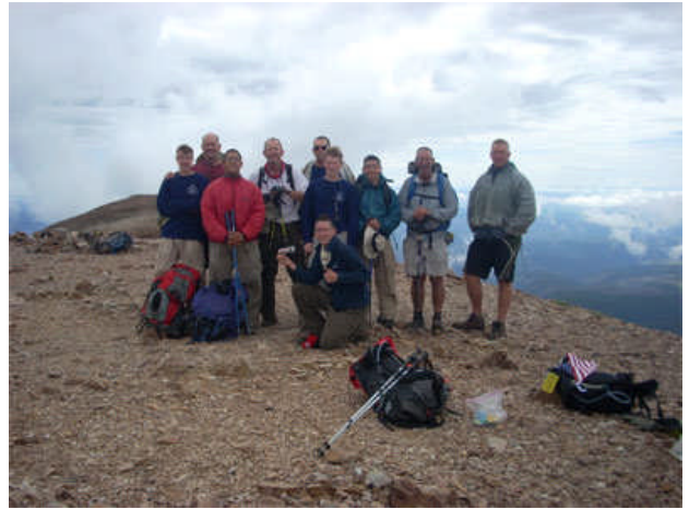
The crew on top of Mount Baldy, 12,415 feet.

Some more 'mainstream' examples of packs that could work well for Philmont: GoLite Jam 2 (six out of twelve people on the WTS-I course carried this), Quest, Pinnacle (maybe a little large for Philmont), Granite Gear Virga, Vapor Trail, Meridian Vapor, Latitude Vapor, Nimbus Ozone; Gregory Z 55; Gossamer Gear G5, Mariposa, Mariposa Plus; Osprey Atmos 50, REI UL Cruise 60, Quick UL 45... lots to choose from. Remember to make sure that each ounce or pound of pack weight really makes a profound difference for you. My original pack was a Dana Design Terraplane that weighed close to 9 pounds empty, which is more than my pack, clothing, and gear now weigh all together.