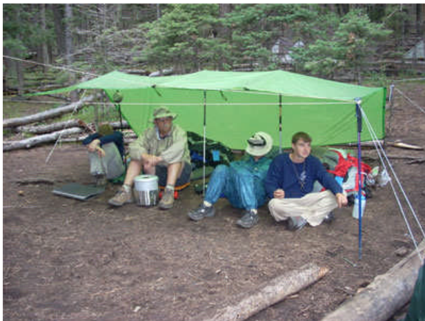
Part of the crew cooking and waiting out a drizzle under the dining fly. Note the Dri-Ducks and Frogg Toggs rainwear.

Hats generate a lot of different preferences: wide brim, waterproof, baseball cap, etc. In 2008, I used a waterproof Mountain Hardwear Stimulus hat, since I was bringing a rain jacket that did not have a hood.