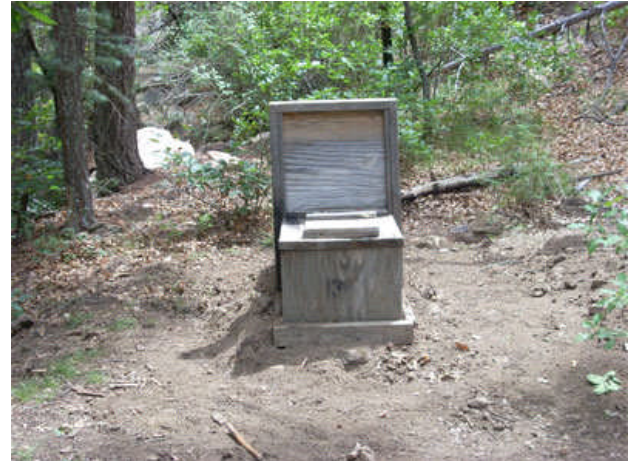
The Pilot to Bombardier outhouse: Two seats back-to-back with some of the best views anywhere, though conversation is usually minimal.

In 2008, I used the same Gossamer Gear G5 pack (2,800 ci body, 3,800 ci maximum, silnylon version) that I used in 2005. It is really hard to argue with a pack that weighs less than 8 ounces. In 2008, the three people that had packs weighing over 20 pounds were either carrying a GoLite Gust (4,500+ cubic inches) or large