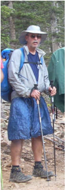
Author in his rain gear, Mountain Hardware Stimulus hat and jacket, along with the ULA rain wrap. The stuff in the G5 pack is protected by a plastic pack liner inside.