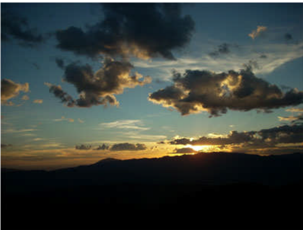
Sunset from Mount Phillips, 11,711 feet.

The cook kits Philmont provides range in weight from 4 to 6 pounds per cook group, and cutlery kits weigh 0.5 pound. Our crew cooks as one group, and we use a 6-liter pot (4 liters is a bit small), and a 2-liter pot for some desserts. Another option for desserts is to mix them in plastic bags. Replace the pot lids with heavy duty tin foil lids, which will be lighter, and tape off the sides of the pots and spray the bottoms with black high temp stove paint. The black-bottomed pots will boil water much faster, conserving fuel and speeding up the food prep process. Also, all stoves should be used with some sort of foil wind screen, even if it is not windy. Leave the frying pan at home. The only cutlery item you need is a large spoon and a serving cup with a handle. Leave the spatula at home. A large number of crews have used the turkey bag cooking method while at Philmont because cleanup is a snap.