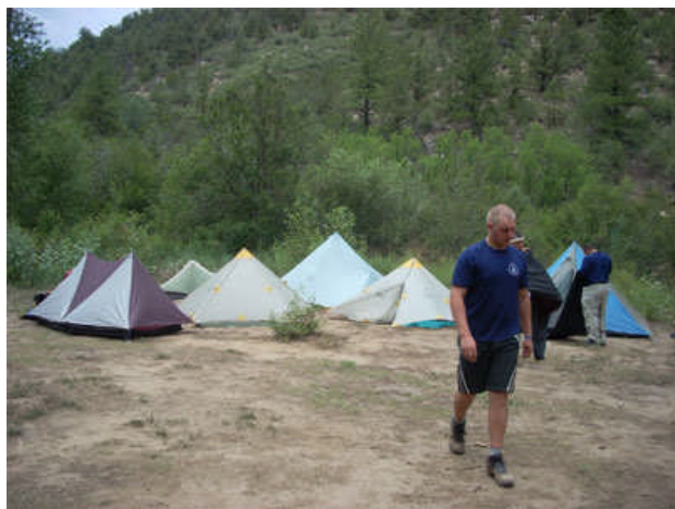
Various Black Diamond, Sierra Designs, and Mountain Laurel Designs tents for our crew. The biggest and lightest one in the back is the MLD.

One of the easiest ways to get a lighter pack is to buy a digital scale and weigh all of your gear, then put the weights into a spreadsheet. You will be amazed at the differences in weights between similar items. Your choices become really easy and, before you know it, you'll be saving pounds. There are even premade gear spreadsheets at BackpackingLight (search "spreadsheet").