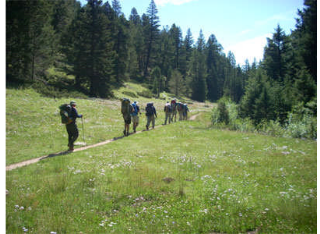
Crew heading down the trail. Some folks apparently enjoy being pack-mules.