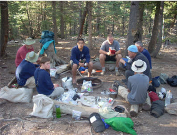
Crew awaiting dinner. Please hurry!

more tie-outs and a lighter fabric; our Scoutmaster loves having lots of space in his tent, and with just the two of us it was a palace. The MLD Spintex MID weighed just less than 24 ounces with stakes, guylines, seam sealing, and stuff sack. We always use our trekking poles instead of carrying a separate tent pole.