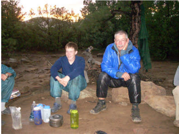
The author (right) and patrol leader waiting for dinner. The author is wearing a Patagonia R1 Hoody under Backpacking Light Cocoon UL 60 Pants and Jacket.

Water: How much to take and how to carry it. This is one of the areas I have tried to work on the last few years, and Philmont is a perfect proving ground. In the past, I carried a 100-ounce Camelback hydration system. I made sure it was filled before I left camp each morning. That is nearly seven pounds of water and container, so I have been working on managing the amount of water I carry. For most of my last Philmont trek, I drank approximately two liters of water in the morning before leaving camp, then carried only a 500 ml bottle after leaving camp in the morning. Granted, I had to stop a number of times to relieve myself of the two liters during the hike, but I was only carrying one pound of water for the day. I carried water containers to hold 5.5 liters of water to fill on the approach to dry camps. Water is plentiful around Philmont and carrying a small amount is easy and saves a lot of pack weight. One other suggestion when going into a dry camp: eat your dinner for lunch near a water source, since dinners require water, whereas lunches and breakfasts are usually dry.