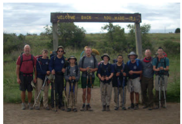
Our crew finishing our trek at basecamp.